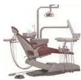
医疗器械 Medical instrument