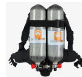
潜水器材 Diving equipment