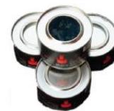
固体酒精 Solid alcohol