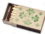
安全火柴 Safety matches